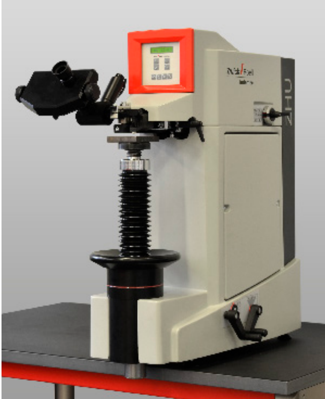
ZHU8187.5 Universal Hardness Tester

ZHU - Universal hardness testers up to 187.5 kg