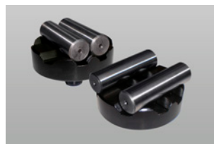
Support tables for round specimens