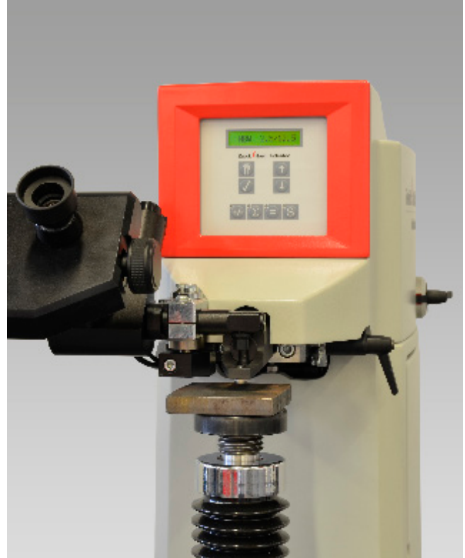
Display of ZHU8187.5 Universal Hardness Tester