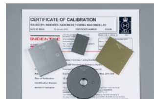
Hardness comparison plate with certificate